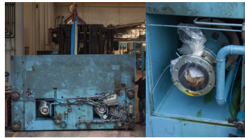
Transport of the presses through the workshops II