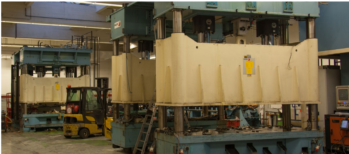
Dismantling, transportation and storage of 4 presses with a weight of 40 tons

Below we have summarized some impressions of a sample project.