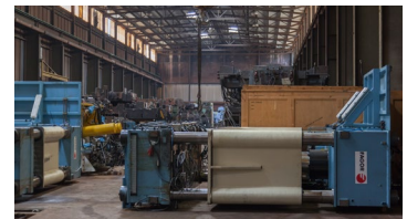
Presses are stored – mission accomplished