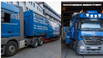
Departure at the customer and arrival at the warehouse