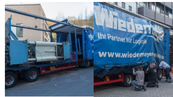
Securing the load