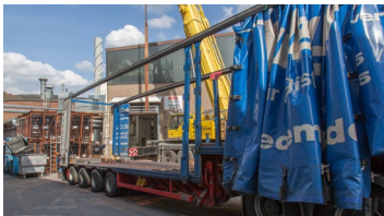
Preparation of the trailer for the transportation