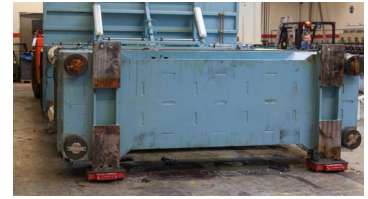
Preparation of the presses for the transport II