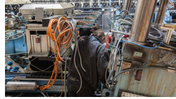
Dismantling of the presses