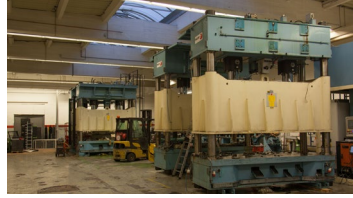
4 presses with a weight of 40 tons each