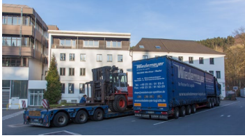
Arrival at the customer in the Sauerland