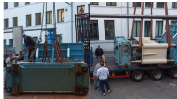
Loading of the presses