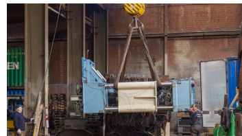
Unloading of the presses