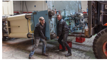
We all need a little fun!