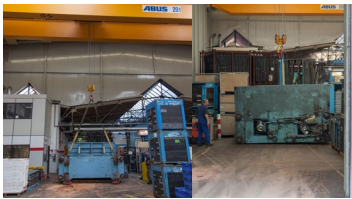
Transport of the presses through the workshops I