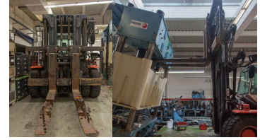
Use of a heavy duty forklift