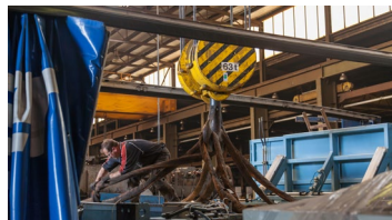
Preparation of unloading of presses