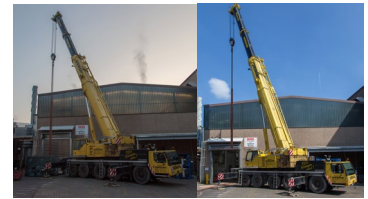
Use of a heavy-duty crane for loading