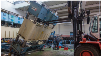
Folding the presses